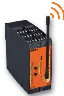
Radio controlled safety module UH 6900